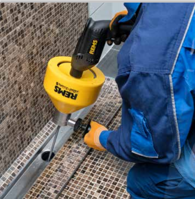
German Quality Product

Drive Proven drive unit with hexagon mount. Enormously powerful. Robust, maintenance-free gear with safety slipping clutch. Universal motor, 630 W, high-torque forward and reverse at low speed. Stepless, electronic speed control. The speed between 0 and 950 rpm is controlled by pressing the tip switch steplessly (acceleration switch).