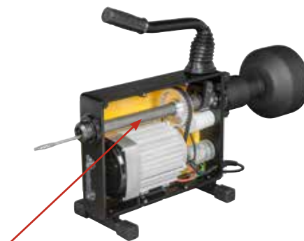
Straight through closed drive spindle protects motor and drive against dirt and water.