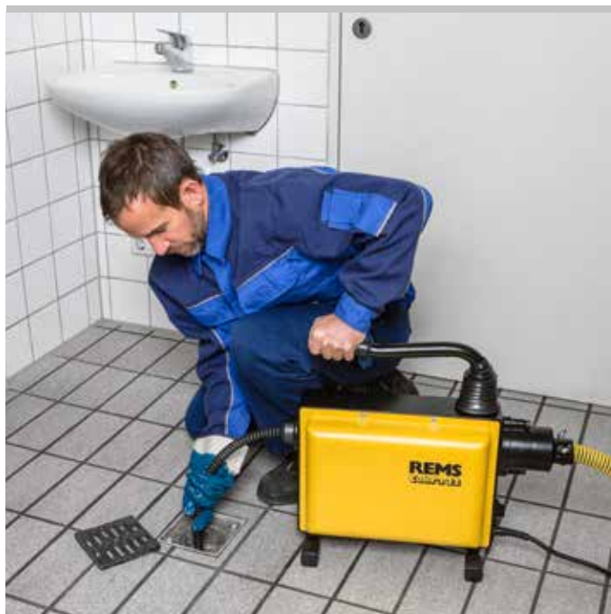
German Quality Product

Large variety of pipe and drain cleaning tools (page 286–287), also fit into pipe and drain cleaning machines of other makes.