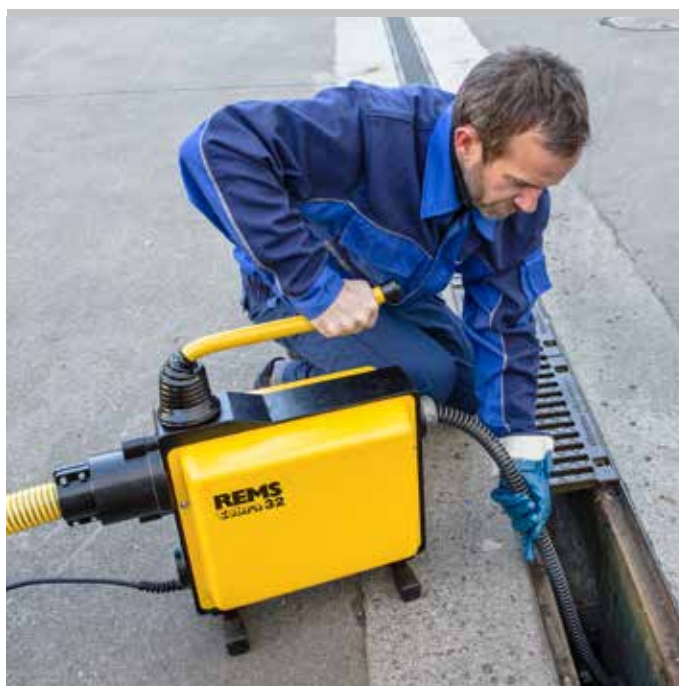
German Quality Product