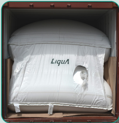
Filling the E-Flex