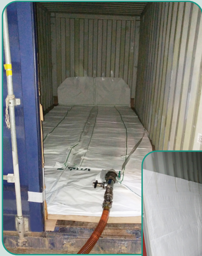
Preparing the E-Flex